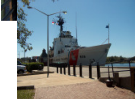
Along the Cape Fear River boardwalk.

The APWA Water Resources Conference is an annual event for JEC as it provides sponsorship support for the conference and participates with the full staff. The JEC team also often brings their families with them who enjoy the visit to historic Wilmington, strolling on the boardwalk and experiencing the nearby beaches. The Conference provides a special opportunity for us to learn new information, meet new and old friends, and share ideas and experiences in a relaxed setting. The Conference is an event that we enjoy to the fullest.