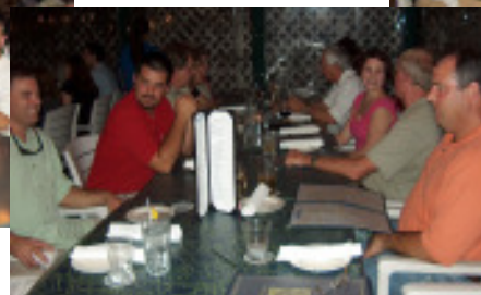
JEC Team, families & associates enjoying dinner at the Pilot House Restaurant.